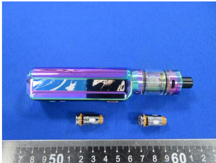
Geekvape Z50 Kit