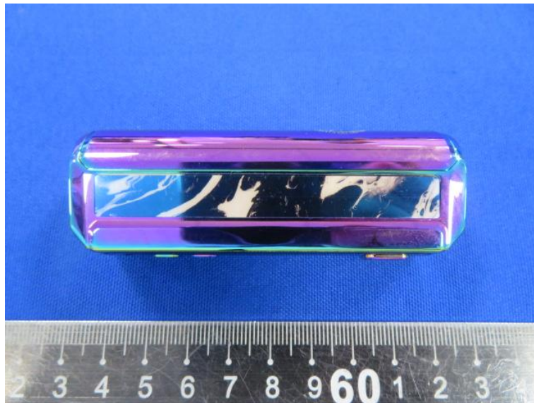
Geekvape Z50 MOD