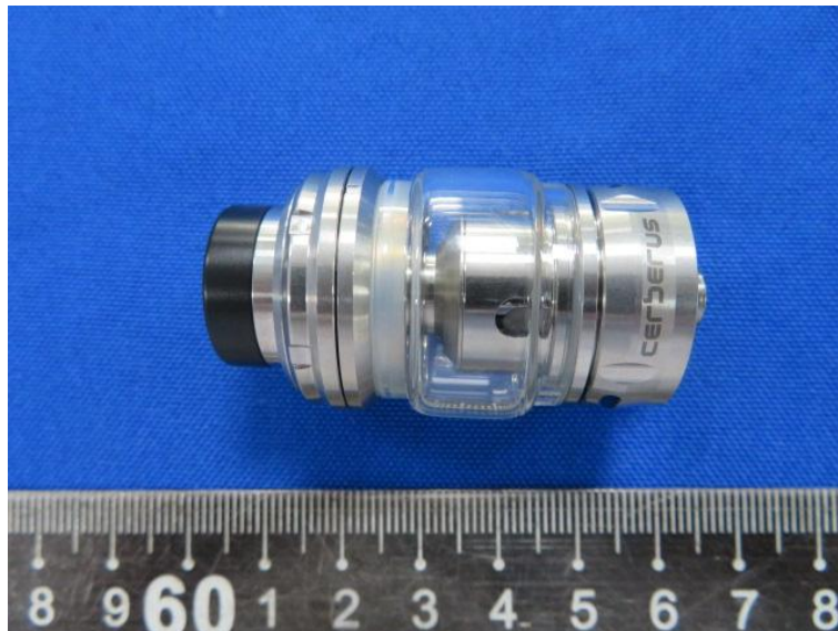
Geekvape Cerberus SE Tank with 0.2ohm 70~80W/0.4ohm 60~70W