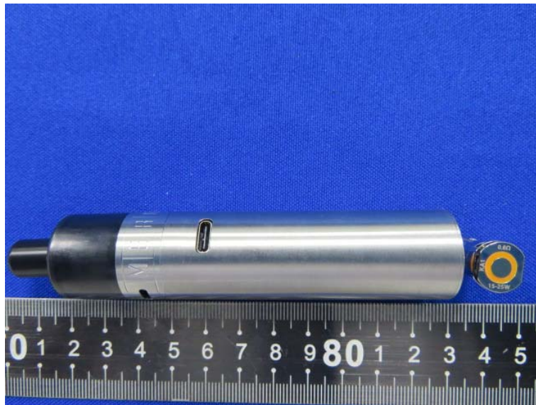
GEEKVAPE MERO AIO KIT with 0.4ohm KA1/0.6ohm KA1