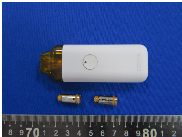
Wenax C1 kit with 0.6ohm KA1/0.8ohm KA1