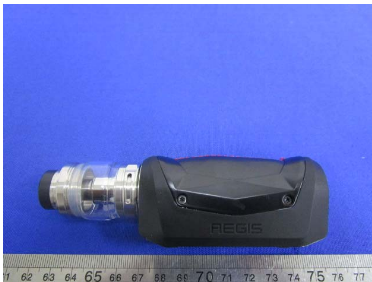
GEEKVAPE AEGIS MINI KIT