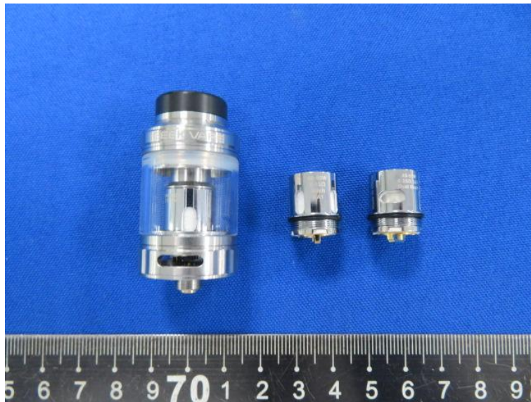
Obelisk C Tank with 0.25ohm(45-55W),FeCrAl/0.15ohm(80-90W),FeCrAl