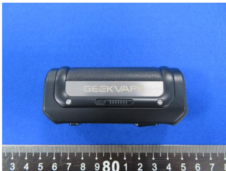
Geekvape M100 MOD (AEGIS MINI 2 MOD)