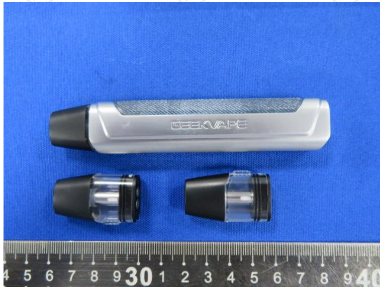
Geekvape 1 FC Kit 0.8ohm FeCrAl (12-16W) /1.2ohm FeCrAl (8-12W)