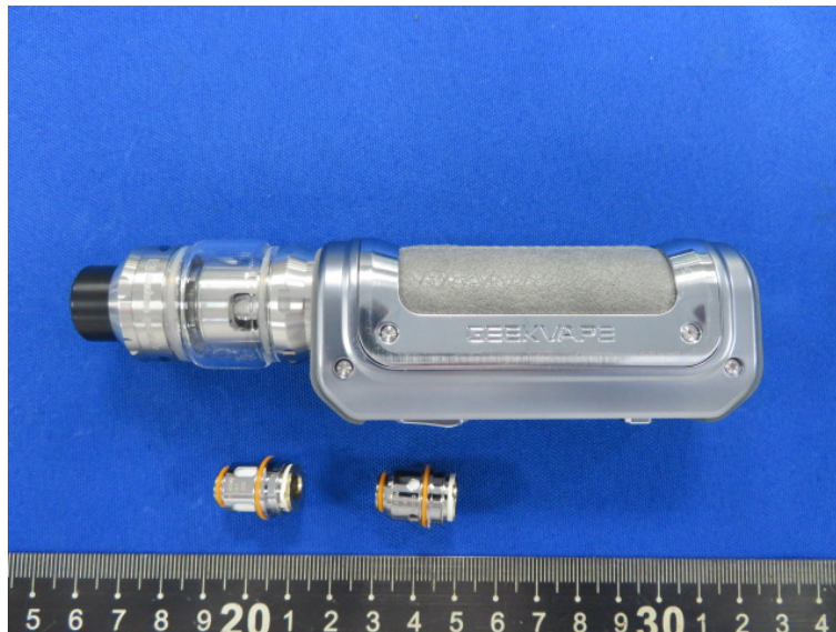
Geekvape Max100 Kit with 0.2ohm/ 0.25ohm