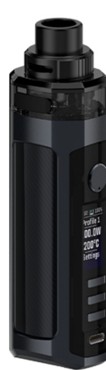
Black Carbon Fiber