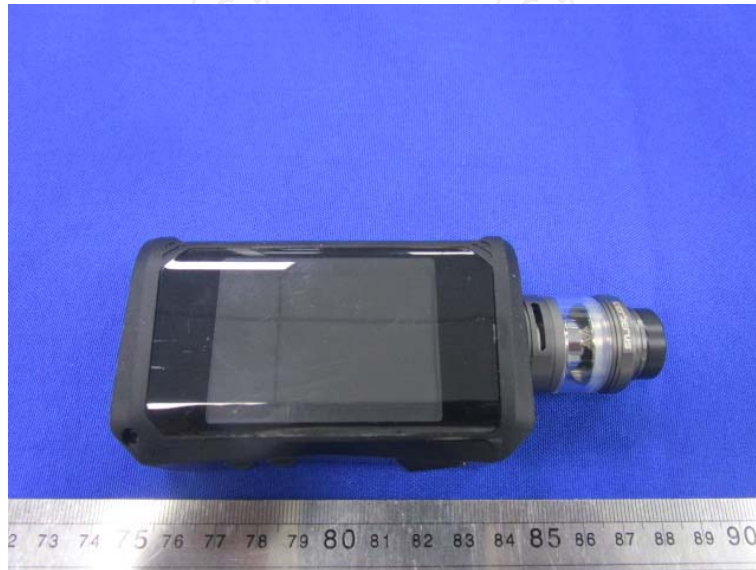
GEEKVAPE AEGIS X KIT 2ML